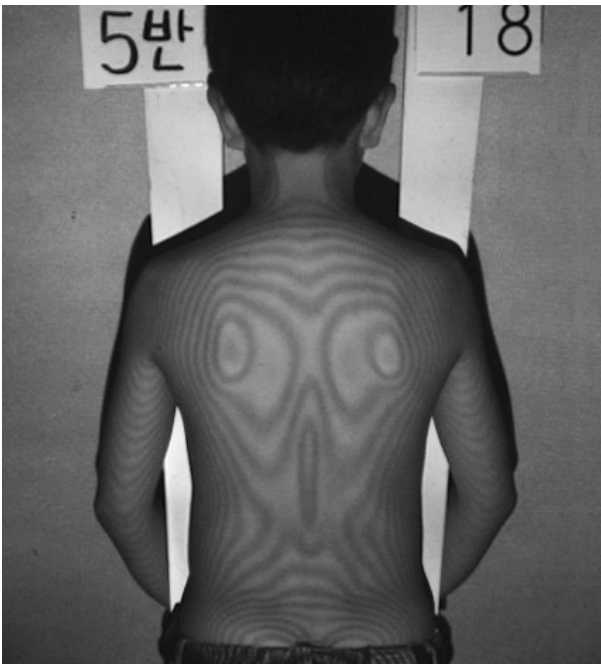
Fig. 1. Moiré topography of a normal back.