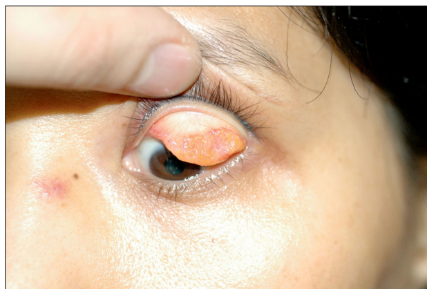
Fig. 1. Papillomatous mass involving the tarsus is shown in the left eye.

A 42-year-old woman presented for evaluation of a slow-growing, painless, palpable mass on the left upper eyelid, which initially developed several years earlier. She was a hepatitis B virus carrier, but otherwise in a healthy condition. No history of orbital trauma or filler injection was reported. At the time of her first visit, her uncorrected vision was 1.0 for both eyes. Under slit-lamp examination, slight conjunctival