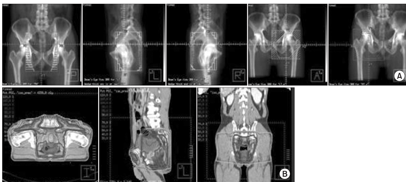
Fig. 2. Beam's eye views (A) and isodose curve (B) of 3-field technique with electron inguinal boost (technique 2).

delivered to all 17 patients. 5FU and mitomycin regimen was given to 70% (12 patients), 5FU and cisplatin was to 24% (4 patients) and 5FU monotherapy was to 1 patient. Twenty-percent reduced dose was delivered to 3 patients over age 70. Two cycles of adjuvant chemotherapy was given to 1 patient with external iliac lymph node metastasis. There was no significant difference in chemotherapy between 2 groups (Table 2).