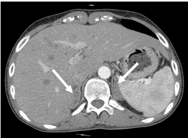
Fig. 2. Abdominal computed tomography showed bilateral hyperplasia of adrenal glands (arrows).

We report a case of male pseudohermaphroditism with life-threatening arrhythmia as the first manifested symptom. A deficiency of 17 \alpha -hydroxylase is well known to cause male pseudohermaphroditism, combined with hy-