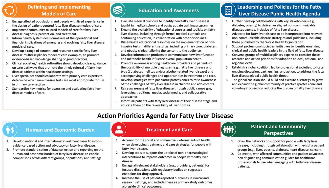
FIGURE 2 Action priorities to turn the tide on fatty liver disease.

the importance of action but the health and economic benefits of this.