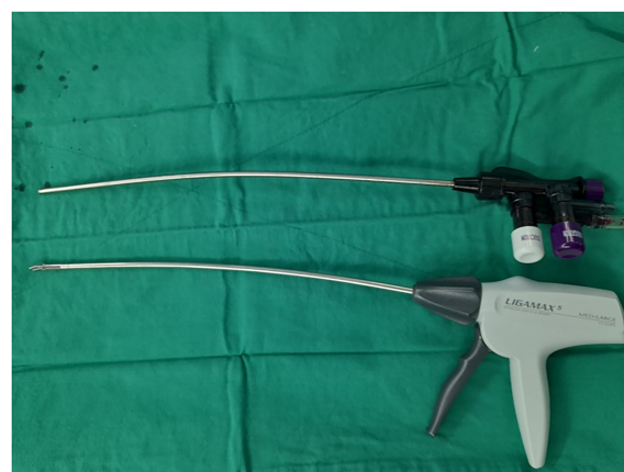
FIGURE 3 Bent suction tube and clip applier shaft

A high rate (5 out of 10 patients) of positive surgical margins, including focal and nonfocal, was identified in final pathology. Nevertheless, four patients of our cohort proved to have extraprostatic disease (pT3a/b) without any preoperative evidence in mp-MRI. Similar