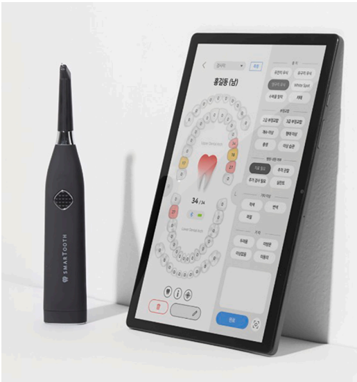
Fig. 2. SmarTooth device.