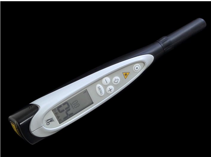
Fig. 1. DIAGNOdent pen.