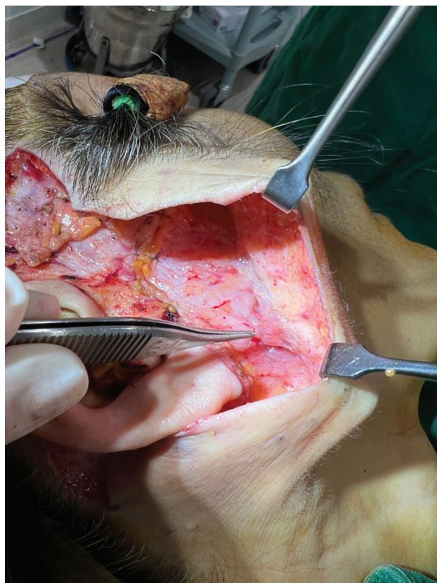
Fig. 2 Intraoperatively, the platysma muscle was found to be ruptured near Lore's fascia and had collapsed to form a lump at the border of the mandible.

was used for the repair. The end of the muscle was sutured near Lore's fascia using size 3-0 vicryl sutures to maintain muscle tension. An extended SMAS dissection was also performed and elevated in the superolateral direction. Skin flap redraping was