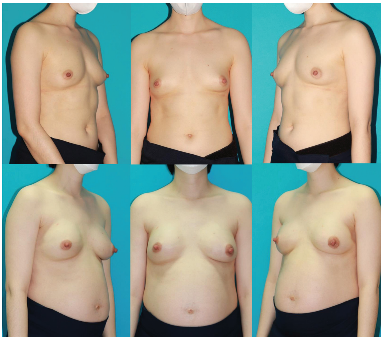
Fig. 3 A 32-year-old patient after a bilateral robot assisted nipple-sparing mastectomy through a longitudinal midaxillary line approach for invasive ductal carcinoma (pT1pN0M0) of the right breast and a prophylactic nipple-sparing mastectomy of the left breast after immediate prepectoral DTI with the superior coverage technique. (above: preoperative appearance; below: postoperative appearance at 1 year).

However, if the oncologic surgeon prefers an inframammary fold incision when performing mastectomy, then the superior coverage technique may be difficult to implement due to a poor visual field.