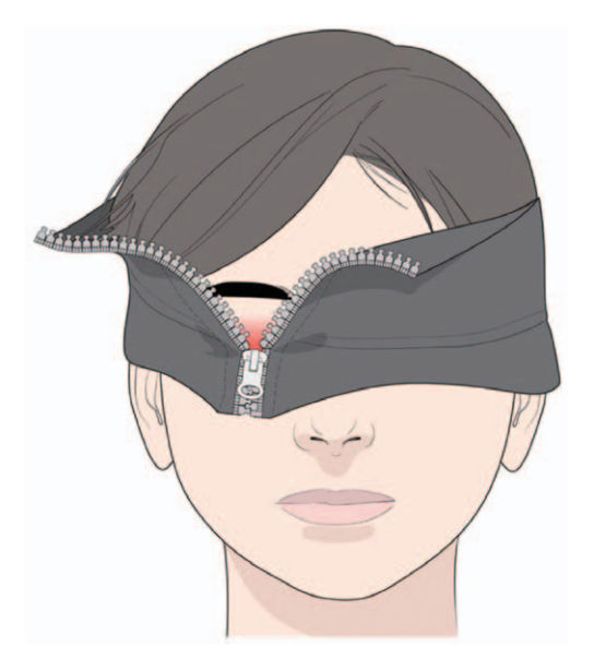
Fig. 1. An 8-year-old girl with the right upper eyelid entrapped in a zipper.

to unzip it, it only caused pain, leaving the entrapment unreleased. Consequently, she was brought to the ED with the upper half of her face covered by the rest of the jacket cut off, only leaving approximately 15 cm above the entrapping zipper (Fig. 1). At the arrival, she was distressed, anxious, and crying with her pain. She had no bleeding disorders or other previous medical conditions,