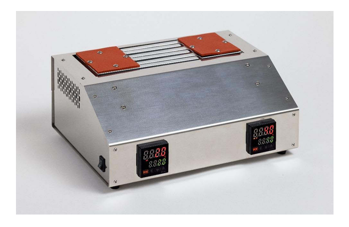
Figure I Image of the thermal grill device.

The thermal grill was designed and manufactured by Anatz (Seoul, Republic of Korea) according to previous validated studies (Figure 1). ^{21-23} The device used for generating the TGI consists of two parts: a control unit and thermal bars. The temperatures of the cold and hot bars were controlled and recorded using a digital thermometer. The temperature of each bar was generated by Peltier elements and finely controlled by the settings of the control unit. The temperature of the cold bar was set to 20\pm2 °C and that of the hot bar was set to 40\pm2 °C. A grill consisting of six 12-mm wide and 120-mm long