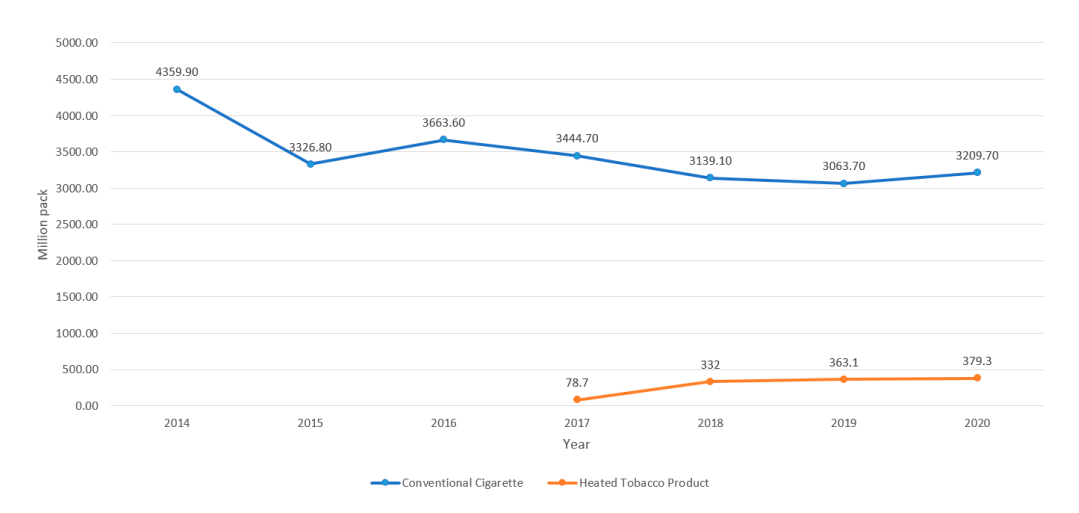
Figure 1. Sales of conventional cigarettes and heated tobacco products in Korea, 2014–2020.