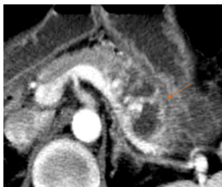
Figure 1 Contrast enhanced computed tomography scan before embolization. Contrast-enhanced computed tomography scan before angiogram reveals swelling of pancreas with pseudocyst in the involved area of arteriovenous malformation (arrow) at the pancreas body and tail.

therapy, surgery, and embolization, and complete resection has been thought to be the ultimate treatment. However, pancreatectomy for AVM has a risk of massive bleeding, and in addition to the invasiveness of the procedure, it can also cause diabetes.