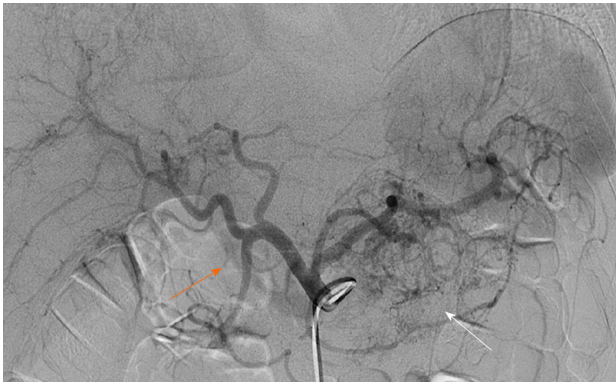
Figure 2 Initial celiac arteriography. Celiac trunk angiography shows numerous fine feeders (white arrow) mainly originating from the left gastric artery, splenic artery and dorsal pancreatic artery, as well as early portal vein opacification (orange arrow).