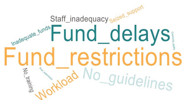
FIGURE 3: Word cloud showing barriers of MCHNP implementation.

It was observed in most of the facilities (70%) that the lower the score on MCHNP governance, the higher the number of barriers mentioned. This was more pronounced in six (6) of the facilities. Furthermore, the Pearson correlation test found a significant correlation between MCHNP governance scores and the number of barriers identified ( r = -1.00 ). The relationship showed that where there was a decrease in governance scores, the number of barriers increased. Similarly, it was noticed in most of the District Health Directorates (60%) that the lower the score on MCHNP governance, the higher the number of barriers mentioned. However, the Pearson correlation test found a less significant correlation between MCHNP governance scores and the number of bar-