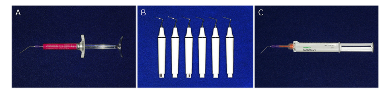
Figure 1. Materials used in this study. ( A ) Endoseal TCS calcium silicate-based root canal sealer and a blunt-end 24-G needle attached. ( B ) The VibraTHO system ultrasonic tips attached to ultrasonic handpieces (prototype). ( C ) GuttaFlow 2 root canal sealer with an intra-oral automixing tip and a blunt-end 24-G needle attached. VibraTHO: ultrasonic vibration and thermo-hydrodynamic obturation.

The conventional SC technique was used with the Endoseal TCS sealer in the SE group. Endoseal TCS was dispensed directly into the canals, no deeper than the coronal half, from a premixed syringe via a disposable blunt 24-G canal tip (Figure 1A). The prefitted master GP points corresponding to X3 of the ProTaper Next system were inserted simultaneously to their full length without any pumping or twisting motion. The excess GP was removed at the canal orifice level with a hot plugger, and the remaining GP point was vertically packed using a cold hand plugger (Figure 2(A1,A2)).