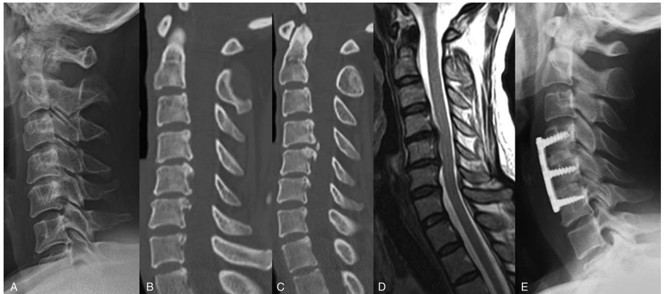
Figure 2. A 43-year-old woman presents with cervical spondylotic myelopathy due to OPLL at C4-5-6. Preoperative radiograph (A) and CT (B, C) examinations are performed. Localized OPLL at C4-5-6 on CT; T2W sagittal MRI (D) showing cord compression due to OPLL; ACDF is performed at C4-5-6 (E).

muscle injury when operating the OPLL. Moreover, preoperative clinical outcomes of both groups improved after surgery. There were significance differences in the clinical outcomes between the preoperative period and at the final follow-up ( P < .001 ).