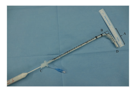
Figure 2. Set-up of the combined lightwand and tracheal tube. We combined the lightwand and tracheal tube as follows. (A) We bent the union at 6.5 to 7.0 cm from the tip of the tracheal tube. (B) The bending angle was about 90 degrees. (C) The plastic material of the lightwand (tube-stop) was impinged into the 15-mm tube connector to hold it together. (D) The bulb of the lightwand was placed at the midpoint of the bevel of the tracheal tube.

performed the lightwand intubation and the case was recorded as a failure.