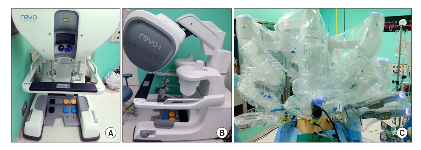
Fig. 1. External view of Revo-i robotic surgical system. (A) Front view of surgical console of Revo-i surgical system. (B) Lateral view of surgical console of Revo-i surgical system. (C) External view after completion of robotic docking to the patient's side ports.

The lesion proved to be a neuroendocrine tumor. Tumor