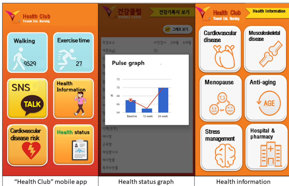
Figure 3. Components of the Health Club mobile app.