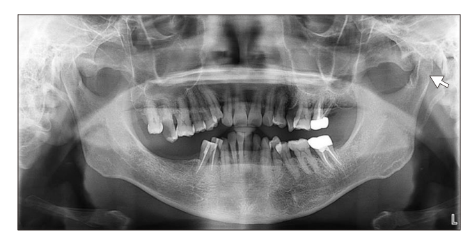
Fig. 2. Panoramic view showing joint space widening of the left temporomandibular joint and the discontinuity of cortical bone of the left condyle (arrow).

Surgical intervention comprising drainage and debridement