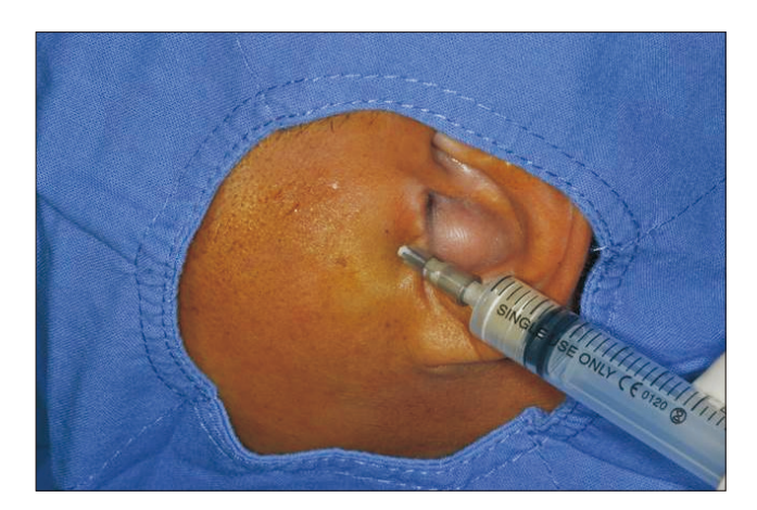
Fig. 5. Yellowish fluid aspirated from the joint space.

discharged after the C-reactive protein levels and white blood cell counts were normalized and his symptoms had improved. Following discharge, the patient was instructed on regular physical therapy including active mouth opening, and periodic follow-up was performed every 2 weeks until there was recovery in the range of mouth opening. At 2 months follow-up, the range of maximum mouth opening was 47 mm.