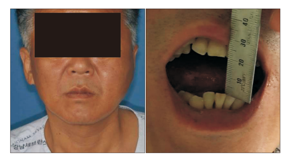
Fig. 1. Swelling of the left preauricular area with restricted jaw movement.

To confirm the diagnosis, needle aspiration of the left joint space was performed with a 5 mL syringe under local anesthesia, and about 1.5 mL of yellowish-brown fluid was aspirated (Fig. 5). Septic arthritis of the left TMJ was confirmed and the aspirated fluid was sent to the laboratory for culture and antibiotic susceptibility tests. Intravenous antibiotic therapy under admission was planned. Cefotetan, which is a second-generation, was used intravenously as