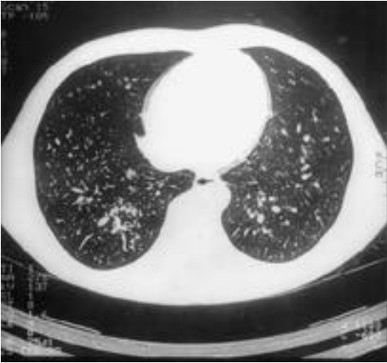
Fig. 2. Centrilobular prominence and adjacent ground glass patterns in the basal segment of both lower lobes.