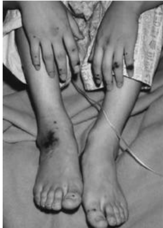
Fig. 1. Purpura on both hands and feet.