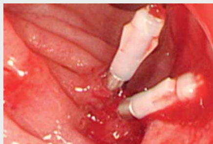
► Video 1 Duodenoscopy findings showed a perforated duodenal fistula with proximal tip of migrated plastic stent. The plastic stent was almost penetrating the duodenal wall. The proximal part of the migrated plastic stent was visible on the duodenal lumen after the cap was pushed during endoscopy. The perforated hole was closed with hemoclips after retrieval of the plastic stent with a snare.