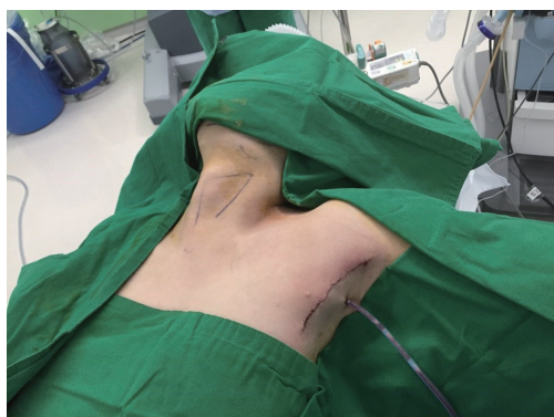
Figure 3 Post-operative skin incision with drain placement.