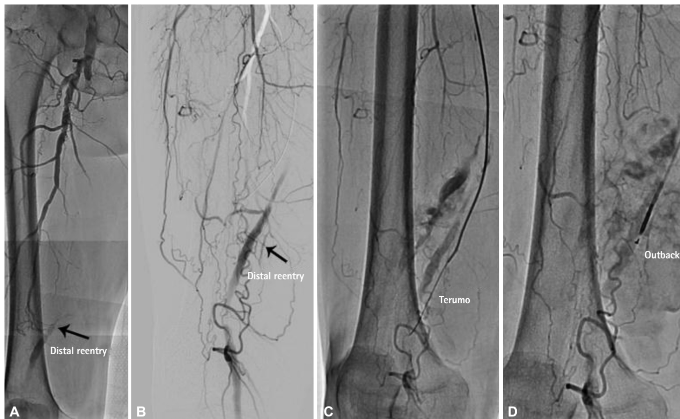
Fig. 1. A total occlusion of about 25 cm of the right superficial femoral artery with reconstitution of the distal superficial femoral artery (A and B) and failure to find the distal re-entry site with a hydrophilic wire (C) and re-entry catheter (D).

distal to the occlusion was not possible (Fig. 1C). Therefore, an Outback Re-Entry Catheter (LuMend, Inc., Redwood City, CA, USA) was used in an attempt to enter the true lumen, but this attempt failed (Fig. 1D).