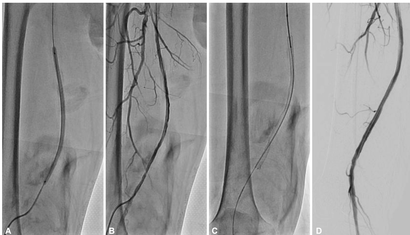
Fig. 3. After dilation with a 6.0×40 mm balloon (A), angiogram shows diffuse dissection of the superficial femoral artery (B). Two self-expanding nitinol stents are placed in the superficial femoral artery (C), which yields a satisfactory final result (D).

or dissection and worsens limb ischemia, the stent cannot be inserted, and only techniques such as long-duration ballooning can be used as alternatives. On the contrary, in case of distal SFA access, the stent may be inserted as far as the adductor canal even when the access site is dissected or occluded. Furthermore, although the procedure can only be performed in the retrograde direction once the patient is turned into the prone position, it can be performed in both ante- and retrograde directions if the patient is maintained in the supine position.