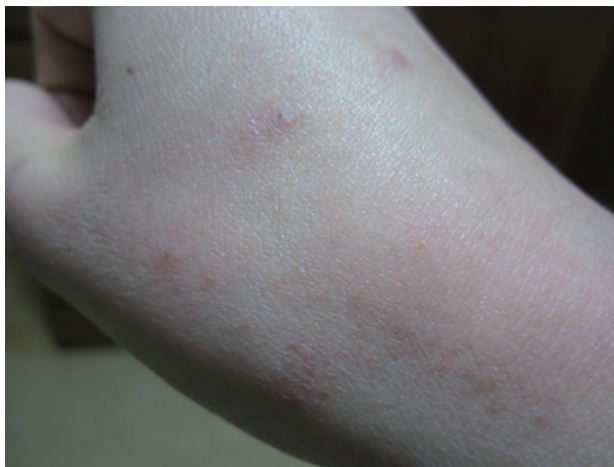
Fig. 1. Erythematous papules with central punctums on the hand of a patient, caused by Cephalonomia gallicola .