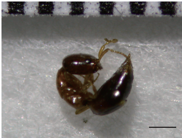
Fig. 2. A female of Cephalonomia gallicola , whole body. Scale bar=0.5 mm.