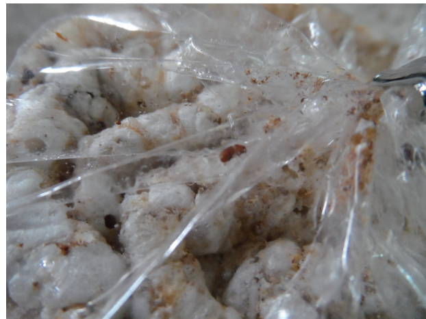
Fig. 4. Cast of Cephalonomia gallicola .

insect was identified to be a female C. gallicola .