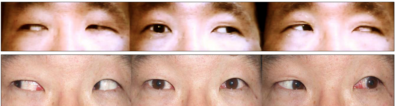
Fig. 2. Photographs of 33 year-old man (patient 3) with 90 prism diopter left exotropia before surgery due to optic atrophy of the left eye (upper). Left medial rectus resection of 11 mm and left lateral rectus recession of 14 mm were performed. Postoperative deviation was nearly straight at 7 months after surgery (lower).

Krimsky methods at 30 cm. All patients gave informed consent for unilateral recession and resection surgery. We carefully explained alternative approaches, namely bilateral surgery; and possible outcomes, especially enophthalmos, narrowing of the lid fissure and limitation on abduction. All operations were performed by one surgeon (JHC) under general anesthesia. Limbal incision was the choice for incision in all cases. Lateral rectus recession was performed first. The amount of recession was determined by the maximal possible exposure of the surgical field at the time of surgery. The amount of resection was planned roughly according to the results of Rayner and Jampolsky [4]. Adjustable sutures were placed on resected medial rectus muscle during surgery, but no adjustments were needed in any of the cases. Conjunctival recession was not performed. Digital photographs were taken preoperatively, at low resolution, and postoperatively, at high resolution, on the day of their last visit, except for case 1.