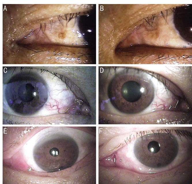
Figure 2 Slit-lamp examination of three patients A: Slit-lamp examination of patient 1 showing a swollen caruncle in her left eye; B: One month after caruncle excision, no recurrence of caruncle swelling was observed; C: Slit-lamp examination of patient 2 showing swollen caruncles in right eye; D: One year after the caruncle excision, no recurrence of caruncle swelling was observed; E: Slit-lamp examination of patient 3 showing a swollen caruncle in the left eye; F: Slit-lamp examination immediately after caruncle excision.

was 4+ in both eyes. We excised the swollen caruncle of both eyes. The symptoms improved by 1mo after surgery; the TMH was 1.0 mm and the FDDT was 1+ in both eyes. At the final 1-year follow-up, no recurrence of caruncle swelling or epiphora was observed (Figure 2C, 2D), and the CAS was 4.