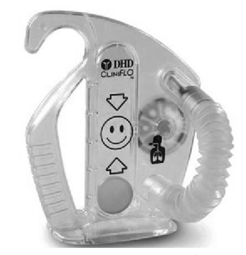
Fig. 2. Incentive spirometer (DHD CliniFLO®).

Participants in the experimental group were treated using a flow-oriented incentive spirometer (DHD CliniFLO<sup>®</sup>, Smiths medical ASD, Inc., Rockland, MA, USA) (Fig. 2), which has a chamber-containing ball. The ball is raised in its chamber upon generation of different inspiratory flow rates (six flow settings from 100 mL/sec to 600 mL/sec) by participants breathing