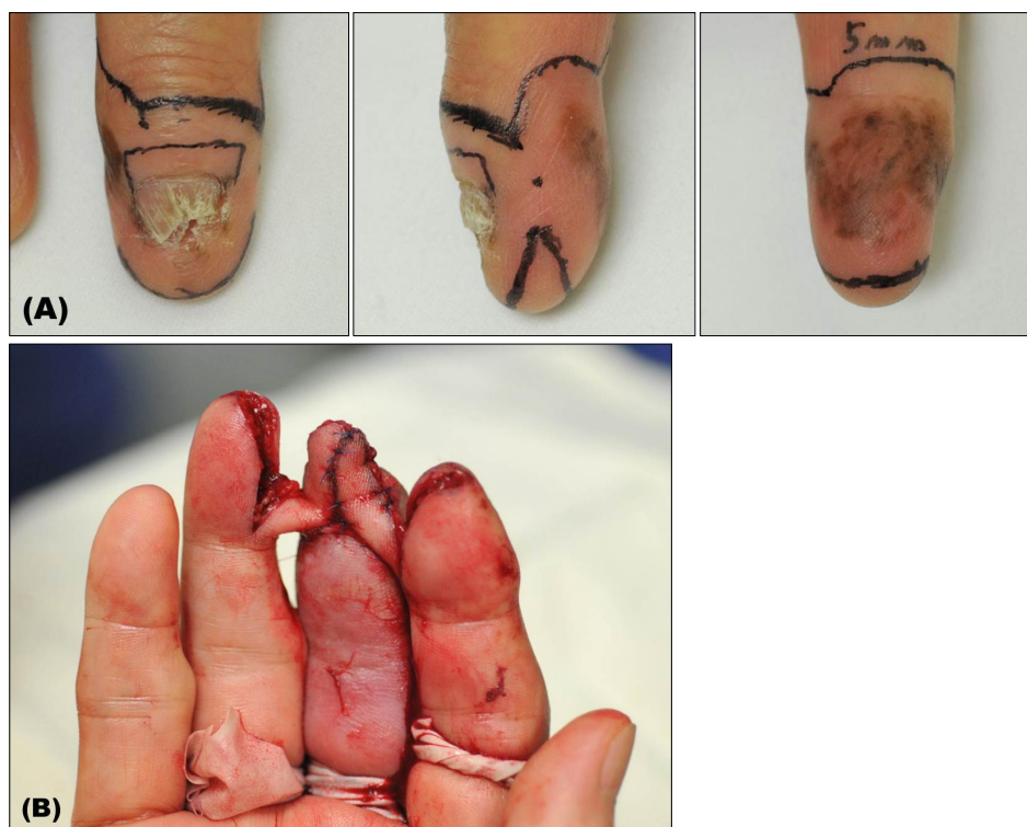
Fig. 3. Clinical images of case no. 4 (female/76). (A) Wide excision was performed with a 0.5-cm safety margin from the pigmented lesion and nail structure. (B) Two months later, an interpolated flap was made using the skin of the adjacent fingers to restore the skin defect.