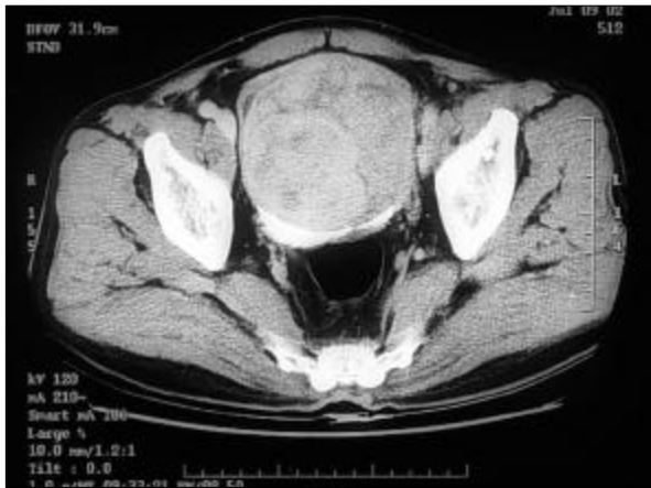
Fig. 1. CT scan revealed a 12 cm sized huge mass with heterogeneous attenuation in the urinary bladder.

rubbery mass. Upon sectioning, dissection revealed a creamy white, multinodular, whorled fibrotic cut surface that very much resembled a leiomyoma of the uterus (Fig. 2). Microscopic examination revealed haphazardly arranged spindle cells with a lace-like deposition of inter- and pericellular collagen with multifocal hypercellular areas (Fig. 3A & 3B). These areas showed plump tumor cells with moderate cellular atypia and increased mitotic figures (2-3/ 10HPF). The immunohistochemical stain revealed CD34 and bcl-2 positive reactivity (Fig. 4A & 4B) and the results were negative for S-100 protein (Fig. 4C), smooth muscle actin (Fig. 4D), CD99 and desmin.