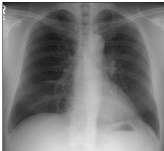
Fig. 2. Chest X-ray film at the time of hypoxemia.

1 ST 7 mm 55/25 mmHg 80% (Fig. 2) 100% 60~65 mmHg, 가 90~94% 40%