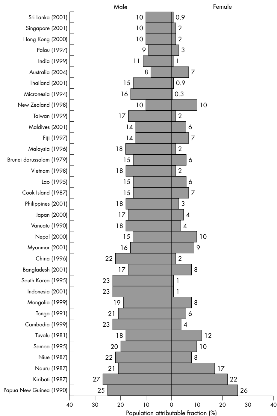
Figure 4 Population attributable fraction (%) of ischaemic stroke caused by smoking.

methods to verify CVD outcomes, and the lack of standardisation could have some effect on the estimation of the HR. Of particular importance for the current study is that only 57% of fatal strokes were classified by subtype and, while pathological diagnoses were verified by imaging or autopsy, limited information was available from many studies.