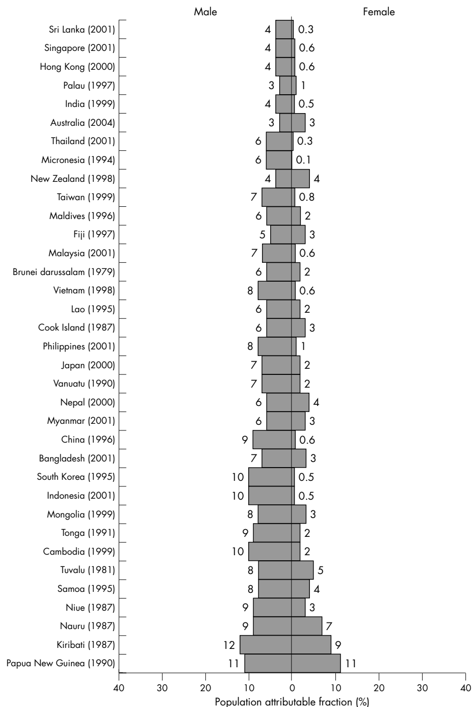
Figure 3 Population attributable fraction (%) of haemorrhagic stroke caused by smoking.

self-reported, dichotomous variable (yes/no) reflecting status at baseline, since few variables on smoking habits are included in the Collaboration. Thus PAFs could not be calculated using duration of smoking, although duration is recognised as more important than daily consumption of cigarettes in determining the effects of smoking on some health outcomes such as cancer. 16 However, the relative importance of duration versus daily consumption smoking measures is less clear for cardiovascular outcomes. 19 If the measurement of the duration of smoking is important for CVD, as it is for cancer, then the inclusion of ex-smokers in the reference group will have led to an underestimation of the RRs associated with current versus never smoking and a concomitant underestimation of PAFs.