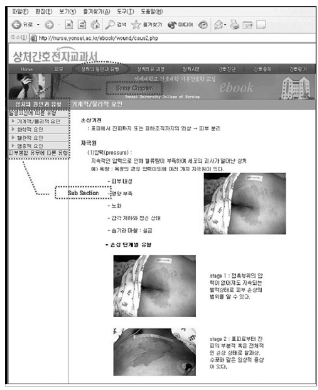
Figure 3. Menu bar of the web-based wound care course

After the course had been completed, a questionnaire was used to obtain formal feedback on the course content, system and student satisfaction. The total mean