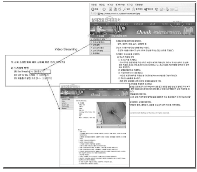
Figure 4. Screen for video streaming of the web-based wound care course