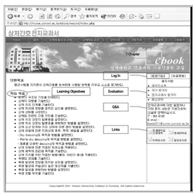
Figure 2. Main screen of the web-based wound care course

The three video streaming formats focused on step-by-step demonstrations as how to assess and how to dress a wound, so that students could easily practice by themselves after watching the video streaming. The streaming video clips of three different methods of wound dressing could be downloaded. To access the video streaming, students could click on the "Nursing Intervention" menu and choose "Wound Dressing" from the menu on the left side and then click on "view the streaming video." Students could move around to choose the chapter and subsection for their self-study by clicking navigation on the top bars and those down on the left hand