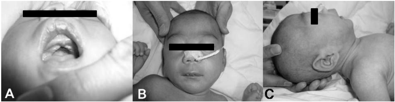
Fig. 1. (A) Unusual round-shaped palatal cleft with incomplete closure of the palate secondary to posterior displacement of the tongue. (B) Frontal view of the face. (C) Lateral view of the face.

mally positioned. The external genitalia were normal (Fig. 1). The skeletal X-rays showed no anomalies.