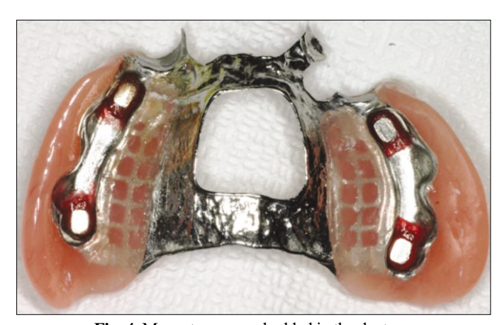
Fig. 4. Magnets were embedded in the denture.

to the patient which involved fabrication of a milled bar with a magnetic attachment.