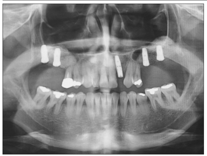
Fig. 1. Panoramic view.