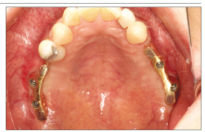
Fig. 2. Milled bars.