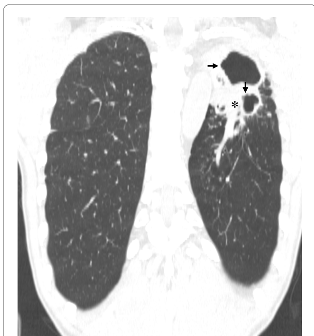
Figure 1 A computed tomography scan of our patient that returned sputum-smear positive for acid fast bacilli. He failed to achieve sputum conversion even after receiving second-line anti-TB drugs for six years. Two thick-walled independent cavities (arrows) are shown in the right upper lobe and a surrounding consolidated region is noted (asterisks).

A thick-walled lesion containing multiple cavities was observed in the left upper lobe of our patient by computed tomographic (CT) examination (Figure 1). A dilated bronchus with thickened wall and two individual granulomas with central caseation were located close to his cavity wall (Figure 2A). His bronchial epithelium was degraded and replaced with a severe inflammatory cell infiltrate. AFB were detected in the caseum inside the bronchus (Figure 2B), indicating that this bronchus was connected to the neighboring cavity. Several multi-nucleated giant cells were found in his peribronchial region (Figure 2B). Metaplastic ossification with fatty marrow replaced a portion of the cartilage plate (Figure 3A). Distribution of calcium deposits was determined by von Kossa staining and a dense band of calcium rimmed the outer edge of his marrow cavity in the cartilage plate (Figure 3B).