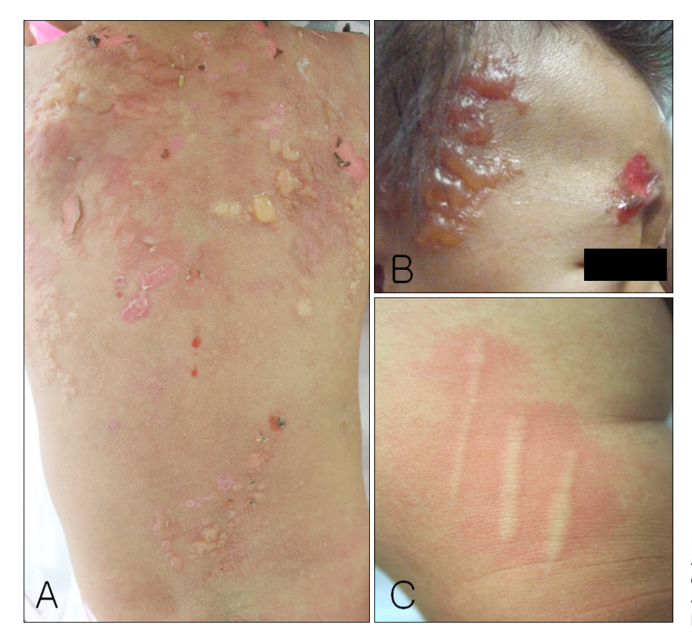
Fig. 1. (A, B) Multiple tense bullae and erosions developed with peau d'orange-like skin on the face, scalp, and trunk. (C) Darier's sign was positive on the thigh.