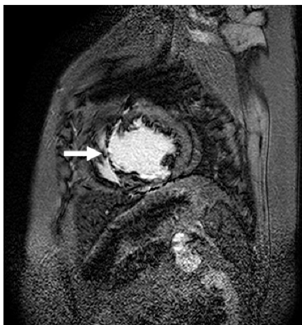
Fig. 3. Cardiac MRI revealed myocardial thinning with transmural delayed hyperenhancement (arrow) on the anteroseptal area.

finer. Moreover, the best treatment for the problems is unknown. In our case, there was restenosis or thrombosis was not present at the fractured stent. Cardiac MRI was performed to formulate the management plan because the anteroseptal wall was already akinetic as determined by previous echocardiography. Considering the absence of a viable portion in the anteroseptal wall as seen on cardiac MRI and the relative small sized coronary aneurysm, we decided to continue clinical follow-up instead of performing an interventional pro-